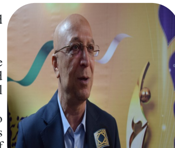
Dr. Zolfi Gol- the Then Minister of MSRT

The Minister also outlined the Ministry's commitment to transforming scientific knowledge into practical technologies. He cited the festival's focus on crowdfunding as a significant step towards achieving this goal, aligning with national economic objectives and accelerating the development of knowledge-based products.