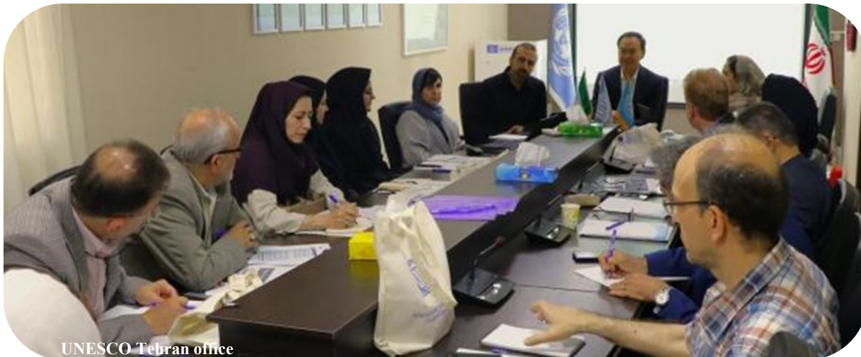
UNESCO Tehran office

On June 24, 2024, the UNESCO Tehran Office (UTO) held a meeting themed "Exploring Cooperation and Enhancing Synergy between Category II Centers and UNESCO."