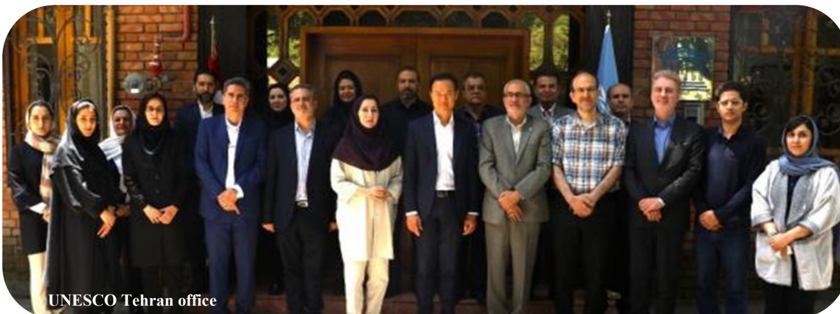
UNESCO Tehran office